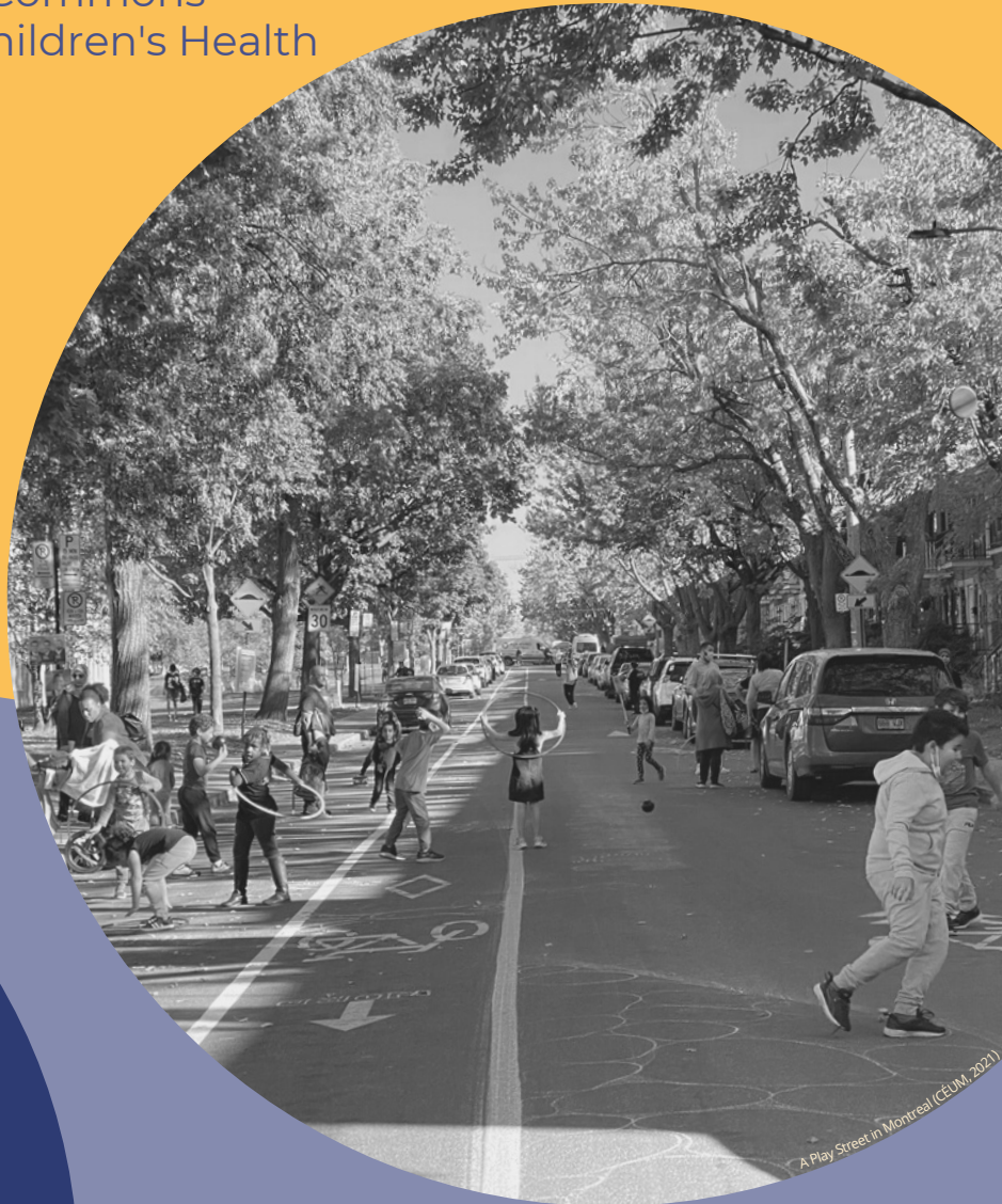
A Play Street in Montreal (CéUM, 2021)