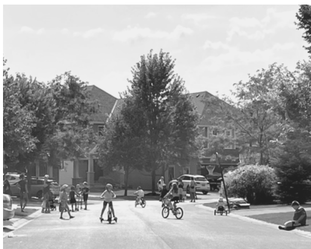
Figure 2: Play Street in Kingston (Healey, 2021)

Reconfigurations that prioritize children, such as Play Streets and School Streets, (22–23) involve closing streets to through-traffic in order to give streets back to children to play, socialize, and be independently mobile. Play Streets (Figure 2) offer children safe spaces to engage in outdoor free play by closing streets within their own neighbourhoods for a predetermined period every week. School Streets (Figure 3) offer children safe spaces to engage in active transport to and from school by closing streets adjacent to elementary school sites on school days.