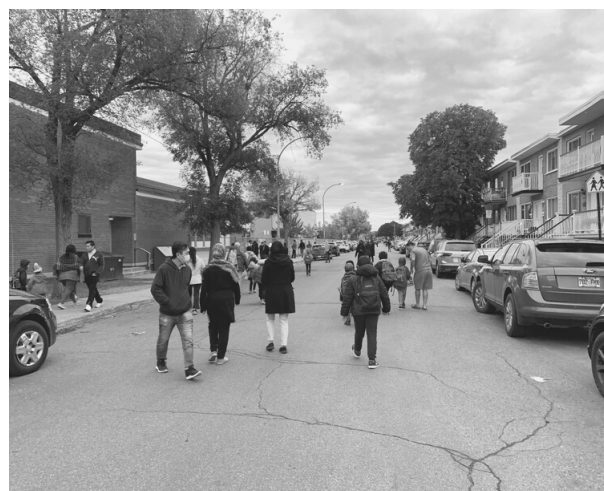
Figure 3: Marie Rivier School Street, Montréal

Over the past few years, our team has collaborated to implement and evaluate Play and School Street interventions in Kingston, Ontario and Montreal, Quebec. Through this work, we have also engaged and helped form a community of practice on these approaches. Drawing from these experiences, we offer recommendations on how to create more child-friendly cities that support the health, well-being, and independence of today’s children and tomorrow’s adults.