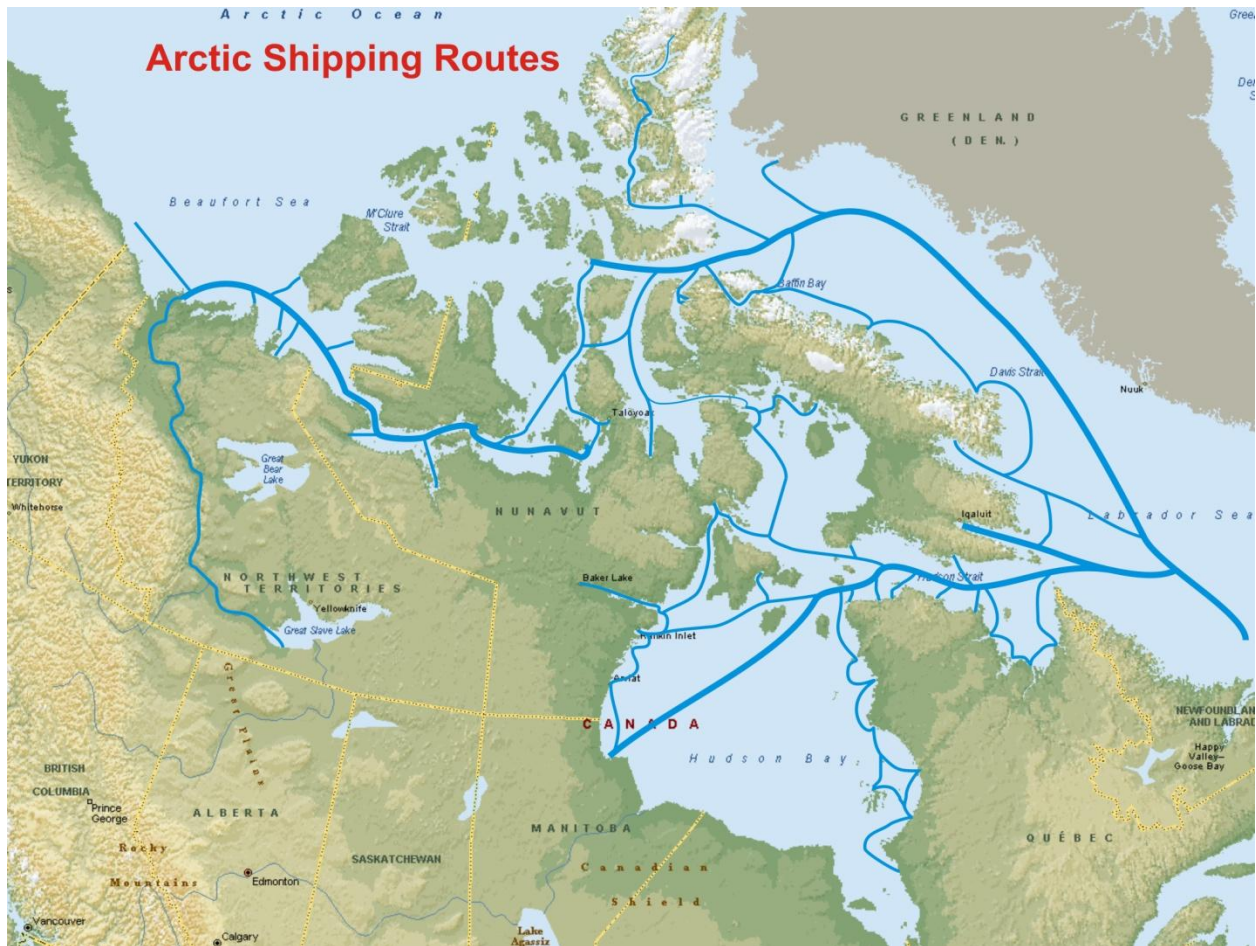
Figure 3 — Shipping Routes in Canada’s Northwest Passage